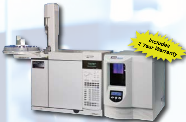
Model H2PEM Hydrogen Generator with Agilent 7890 GC-FID