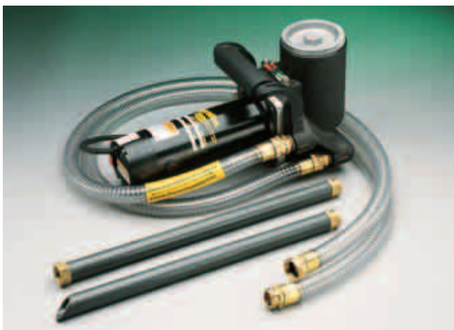
Guardian® Portable Filtration System