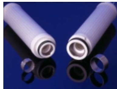
Stainless Steel Inserts

Efficiency, flow capability and service life are similar for all available constructions.