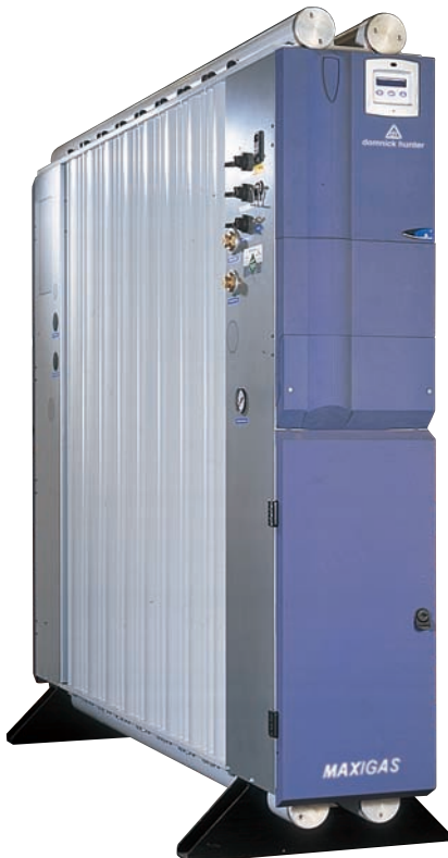
MAXIGAS model N2MAX116