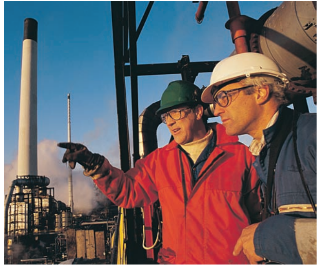
Dependable nitrogen supply for improved occupational safety