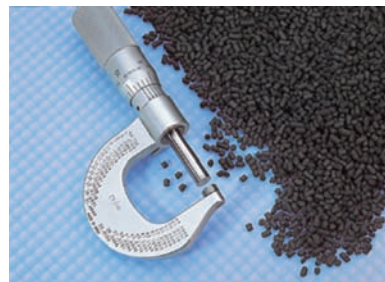
Carbon molecular sieve

After a pre-set time when the online bed is almost saturated with adsorbed gases, the system automatically switches to regenerative mode, venting the contaminants from the CMS. The second CMS bed then comes online and takes over the separation process. The pair of CMS beds switch between separation and regeneration modes to ensure continuous and uninterrupted nitrogen production.